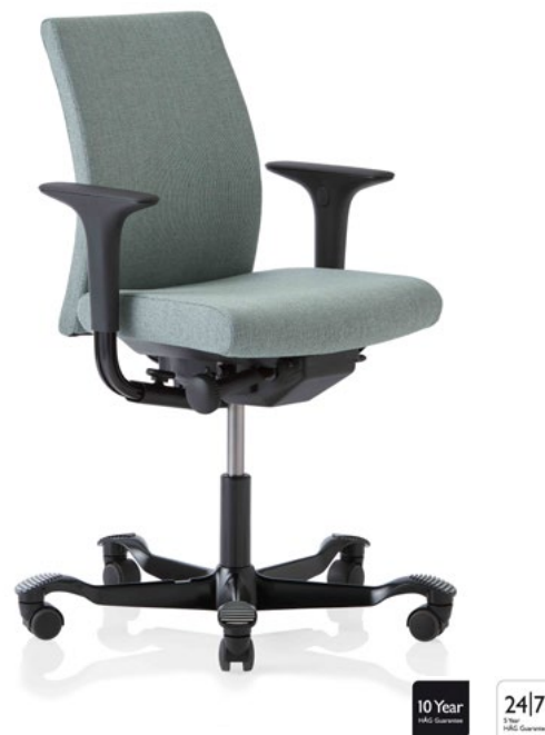
Design: Peter Opsvik. Patent- and design protected.