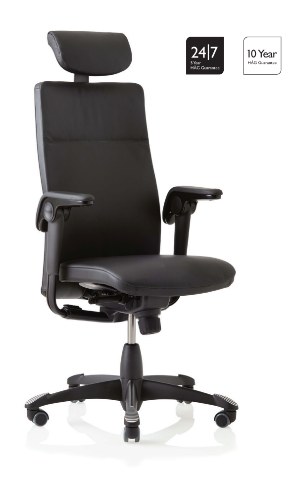
Design: Svein Asbjørnsen/sapDesign®. Patent- and design protected.